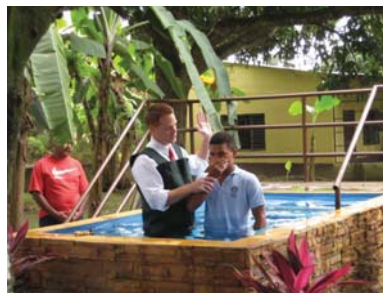
Baptism of new convert

The roof of the church building has been completed and we are now in the process of pouring the floor and finalizing the electric. Please pray that God will continue to provide the funds for this project.