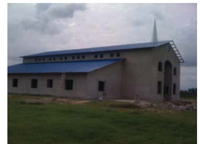
Installation of church roof